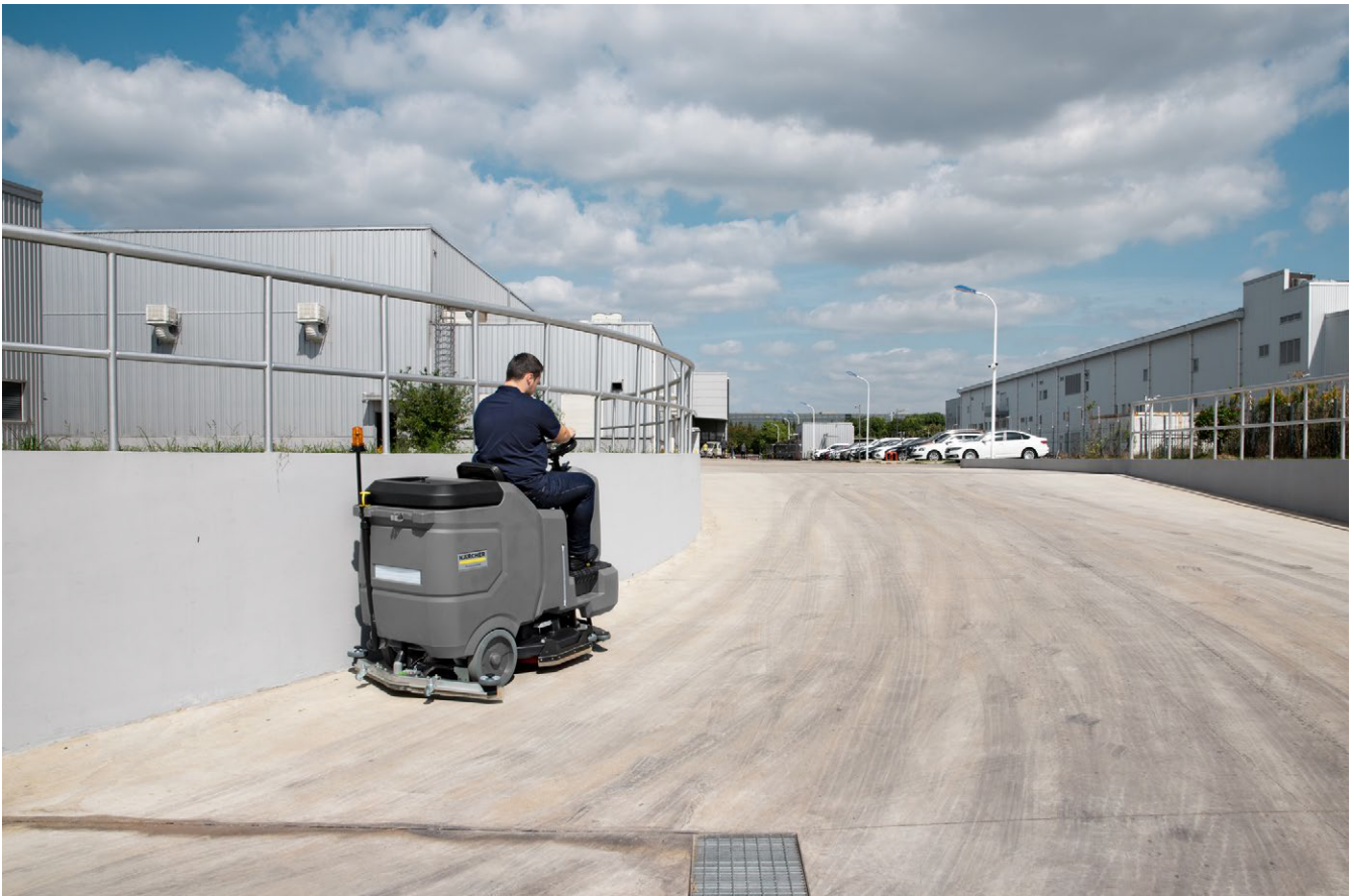
BD 90/160 R Classic Bp